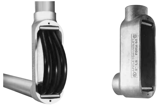
2" Type LB with rollers shown