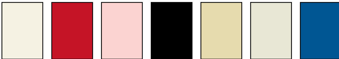
Primer Red Pink Flat Black Ivory Light Almond Blue

To order custom metal wall plates, see Pages P-41 – P-45.