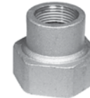
Bell Reducing Coupling