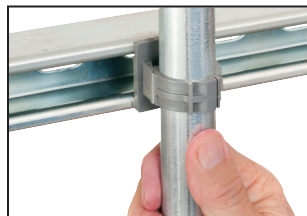
5 Secure installation of conduit to strut.