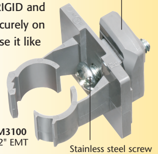
NM3100 1/2" EMT

Arlington's heavy duty NM3100 series QuickLATCH™ with installed strut clip holds RIGID and EMT securely on strut. Use it like a pipe hanger.