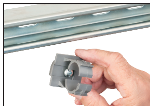
1 Insert QuickLATCH into strut. The strut clip is already attached so you save time.

Fast and easy to install. Insert the hanger into the strut, twist to lock the pre-installed clip in place then tighten screw to secure QuickLATCH to strut. Push RIGID or EMT into the hanger to lock it in place.