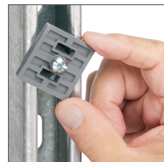
Our QuickLATCH™ Pipe Hanger installs on Strut Clip™