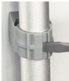
Removable Use screwdriver to lift tab.

Fast and easy to install, one-piece, non-metallic QuickLATCH™ mounts to walls, metal strut and studs, and threaded rod up to 1/4"-20...works with Arlington's Strut Clip™ too. Strut Clip holds pipe hangers securely on strut.