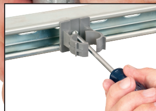
3 Tighten screw for secure installation on strut.