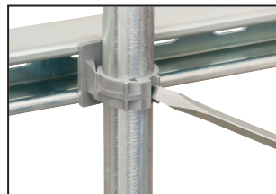
Easy screwdriver removal