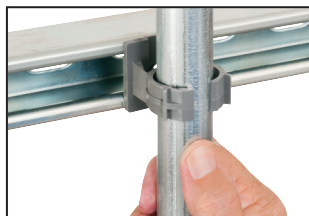
4 Push conduit into QuickLATCH to snap in place.