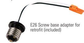
E26 Screw base adapter for retrofit (included)