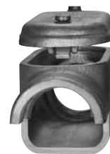
Appleton FM7 (C57, 1-1/2") 28 Cubic Inches Capacity Flat-Back Design

Illustrated views are cut away to demonstrate back configurations.