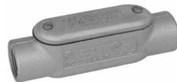
Conduit Body with Cast Aluminum Cover, 1" Type C shown