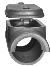
Crouse-Hinds Form 7 (C57, 1-1/2") 26 Cubic Inches Capacity