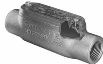
Grayloy™-Iron, 1" Type C shown with cut-away body and cover to illustrate Wedge-Lok™ Clip Cover detail

Illustrated views are cut away to demonstrate back configurations.