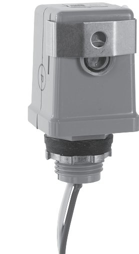
K4121C, K4123C, K4127, K4135, K4141C