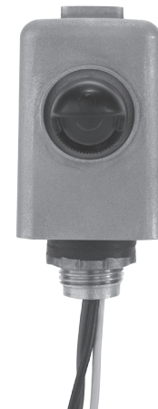
K4136M, K4421M, K4423M