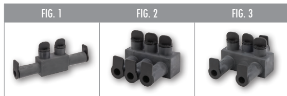
Figure varies by number of wire ports.