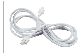
HU1011 18" Daisy Chain Connector