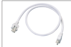
HU1010 12" Daisy Chain Connector