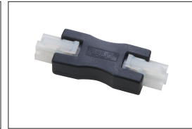
HU107 1-1/2" Male-to-Male Connector

Finish: P = White; MB = Matte Black Example: HU101P = 3" Daisy Chain Connector, White