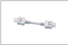
HU101 3" Daisy Chain Connector