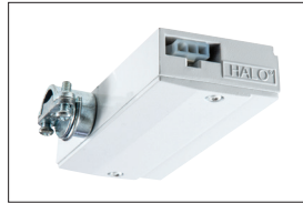
HU109 Splice Box