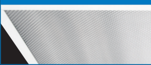
Prismatic Acrylic Doorframe and Lens