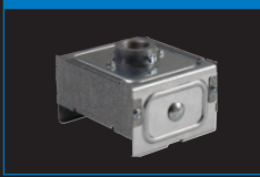
HBL-SPM=Single Monopoint Hanger w/Hub (Galvanized)