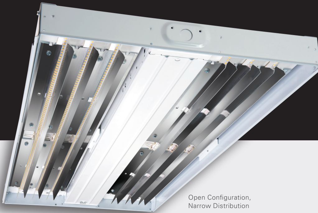
Open Configuration, Narrow Distribution

The HBLED delivers industry-leading performance and reliability for a variety of high-bay applications. Precision designed optics, multiple distributions, lumen outputs and color temperatures make the HBLED ideal for industrial, commercial, manufacturing, gymnasium and other applications that utilize traditional HID and linear fluorescent high bays. The proprietary low-power, low-brightness LED module assembly offers exceptional optical performance with the enhanced benefits of LED lighting, including energy savings, extended system life, and a reduced carbon footprint.