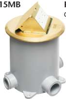
FLBT6615MB open on FLBC4500 concrete box