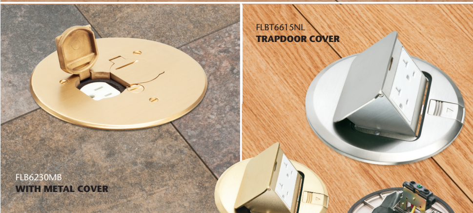
FLB6230MB WITH METAL COVER