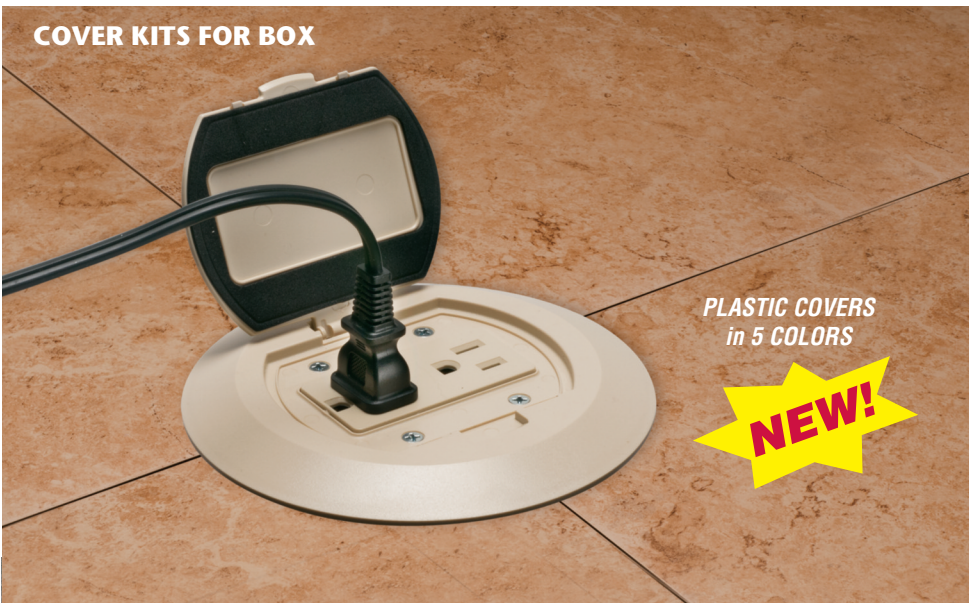
Box without mud cover