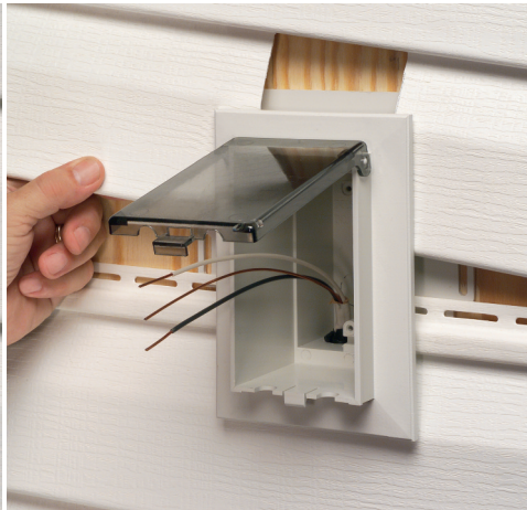
for New & Existing Vinyl Siding