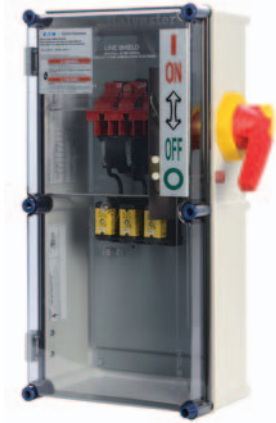
Halyester CUBEFuse Safety Switch with Clear Cover