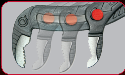
Wider Jaw Opening