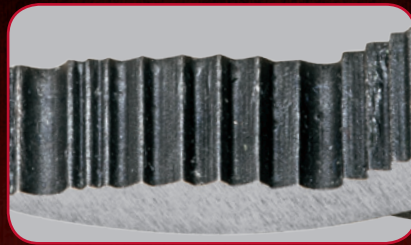
More Gripping Teeth