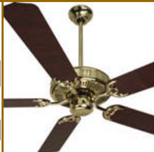
CD52PB BCD5-RW3 Polished Brass finish with Rosewood blades.