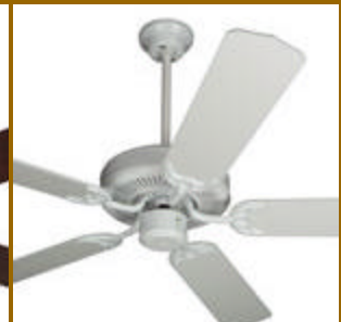
CD52W BCD-5W White finish with White blades.