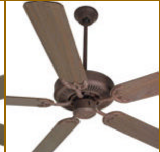
CD52BS BCD5-WWB Brownstone™ with Washed Walnut Birch blades. (Brownstone™ is a registered trademark of Dolan Designs.)