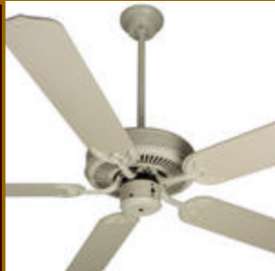
CD52AW BCD-5AW Antique White finish with Antique White blades.