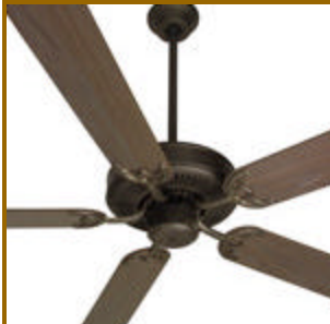
CD52EB BCD5-WB6 Antique White finish with Walnut Satin blades.