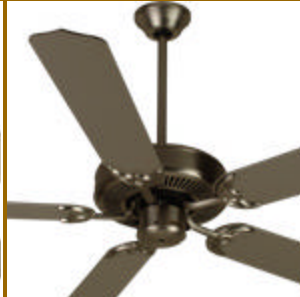
CD52BN BCD-5BN Brushed Nickel finish with Brushed Nickel blades.