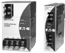
Table 6. PSG Power Supply Selection