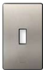
SS Stainless Steel*

*Stainless Steel finish wallplates include black plastic trim/adaptor, visible from side. Match with separate Black (BL) controls.