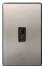
SS Stainless Steel

*Coordinating wallplates only available separately. For wallplate information, see pg. 166.