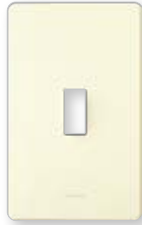
LA Light Almond