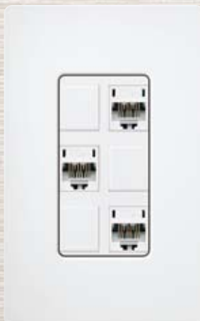
Customizable 6-port frame