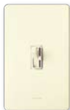
LA Light Almond