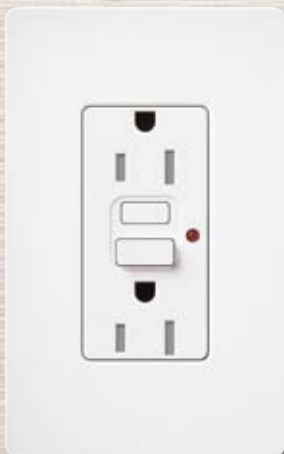
Tamper resistant GFCI receptacle