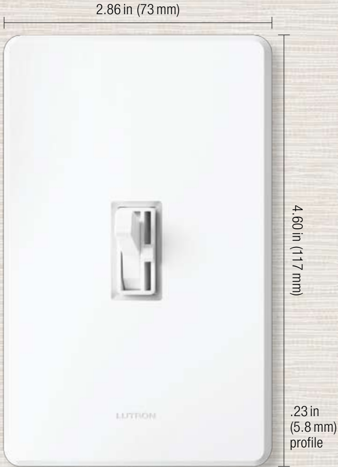
Shown actual size: Ariadni dimmer and 1-gang Fassada wallplate in White (WH).