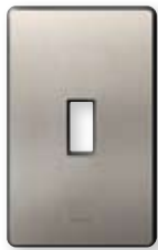
SS Stainless Steel*

*Stainless Steel finish wallplates include black plastic trim/adaptor, visible from side. Match with separate Black (BL) controls.