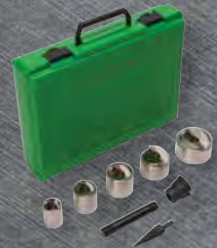
SPEED PUNCH™ KIT (without driver)*

Look for SPEED PUNCH™ products and "Try Me" display at supporting Greenlee distributors.