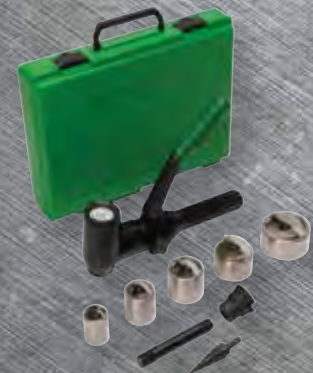
SPEED PUNCH™ KIT (w/Quick Draw 90 Driver)