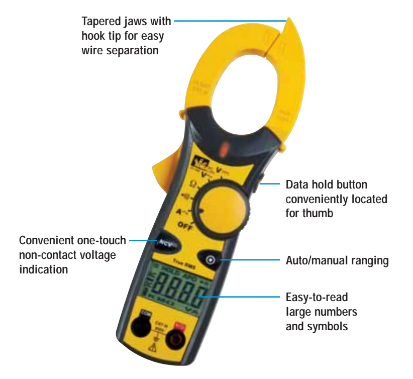
Jaw Size 1.25" (32 mm)