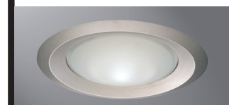
6150SN Satin Nickel Reflector