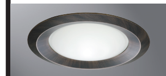
6150TBZ Tuscan Bronze Reflector