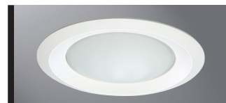
6150WH White Reflector

*UL1993 listed LED & CFL equivalent lamps permitted. Consult lamp manufacturer for conditions of use. Eaton does not warranty the lamp.