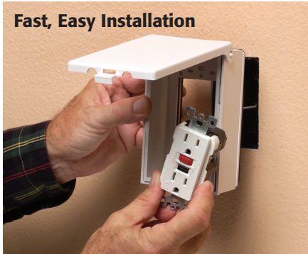
Fast, Easy Installation

Fits over All Boxes and Openings in New or Old Work