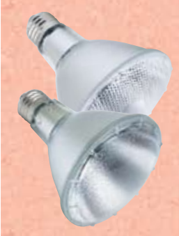
PAR30 Longneck Spot Flood