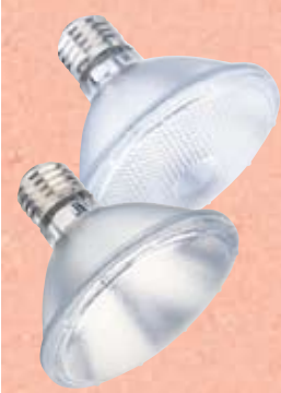
PAR30 Spot Flood