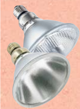
PAR38 Spot Flood