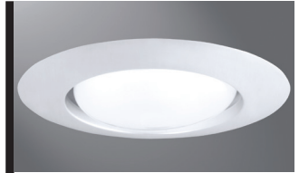
401P White Open Trim

*UL1993 listed LED & CFL equivalent lamps permitted. Consult lamp manufacturer for conditions of use. Eaton does not warranty the lamp.