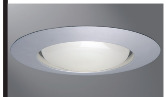
401AL Satin Aluminum Open Trim