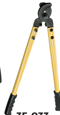
35-033 1000 MCM