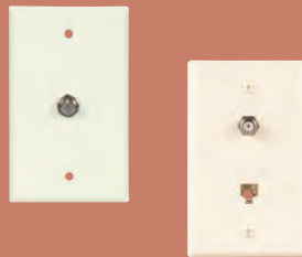
Standard Size Wallplates with Connectors D-13