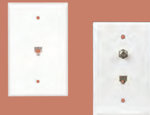
Mid-Size Wallplates with Connectors D-13