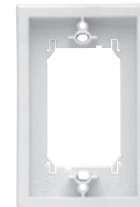
1594TPAW EXTENSION RING