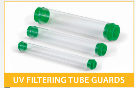
UV FILTERING TUBE GUARDS

* Note: Tested by two (2) independent light testing laboratories.