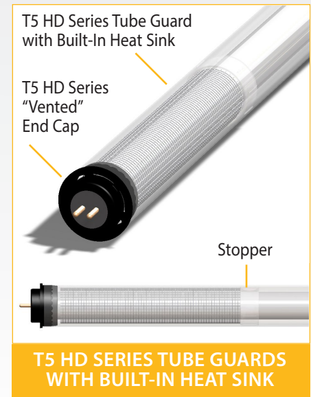
T5 HD SERIES TUBE GUARDS WITH BUILT-IN HEAT SINK

Simply insert the lamp into the T5 HD Series Tube Guard, insert the “vented” end cap on each end of the tube guard and install the “tubed” lamp into the luminaire.