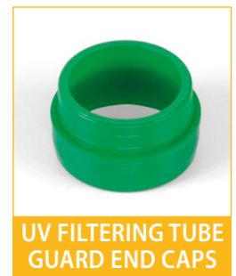
UV FILTERING TUBE GUARD END CAPS

Note: End Caps for T5, T8 and T12 Tube Guards fit inside the Tube Guard.