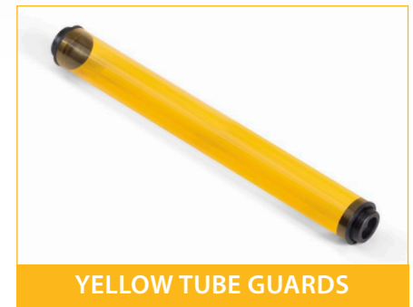
YELLOW TUBE GUARDS