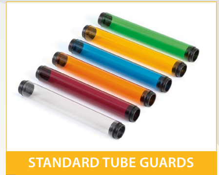
STANDARD TUBE GUARDS