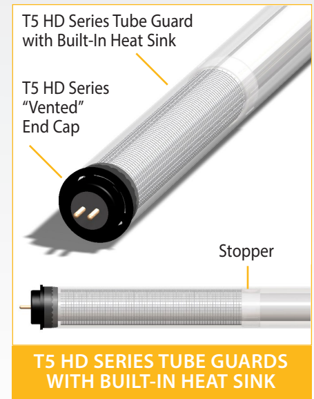
T5 HD SERIES TUBE GUARDS WITH BUILT-IN HEAT SINK

Simply insert the lamp into the T5 HD Series Tube Guard, insert the “vented” end cap on each end of the tube guard and install the “tubed” lamp into the luminaire.