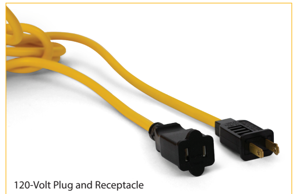
120-Volt Plug and Receptacle