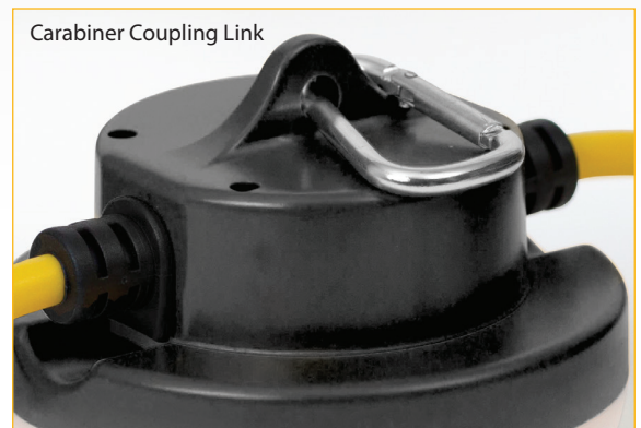
Carabiner Coupling Link