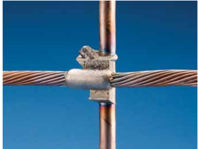
Completed GY connection