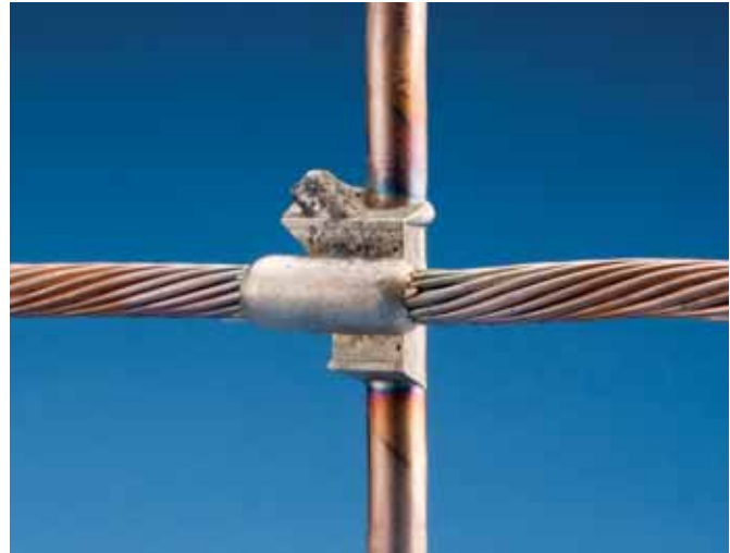
Completed GY connection