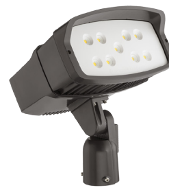
Vandal Guard (Polycarbonate lens) OFL2VG