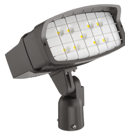
Wire Guard OFL2WG