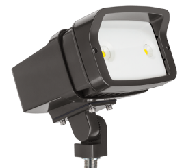
Vandal Guard (Polycarbonate lens) OFL1VG